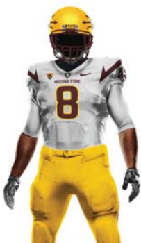
GOLD, WHITE, GOLD