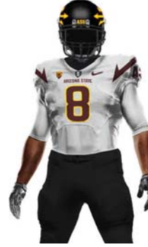
BLACK, WHITE, BLACK