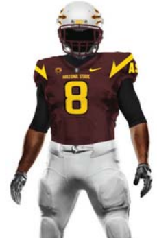
WHITE, MAROON, WHITE

9/24- ASU 43, USC 22 11/25- Cal 47, ASU 38