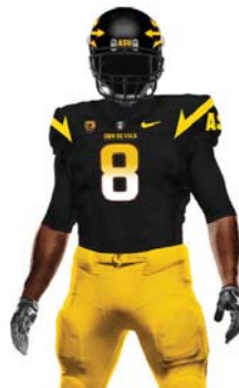
BLACK, BLACK, GOLD