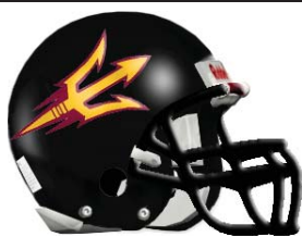
Arizona State Sun Devils 6-6