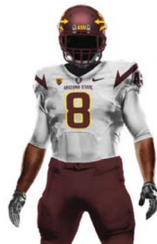
MAROON, WHITE, MAROON

10/8- ASU 35, at Utah 14 11/12- at WSU 27, ASU 27