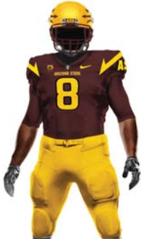
TRADITIONAL (Gold, Maroon, Gold)